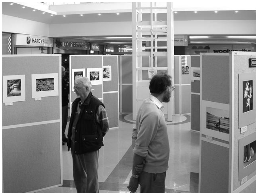
Coastlands Exhibition ( See Page 2 )

Volume 28, Issue 10 NEWSLETTER November 2004