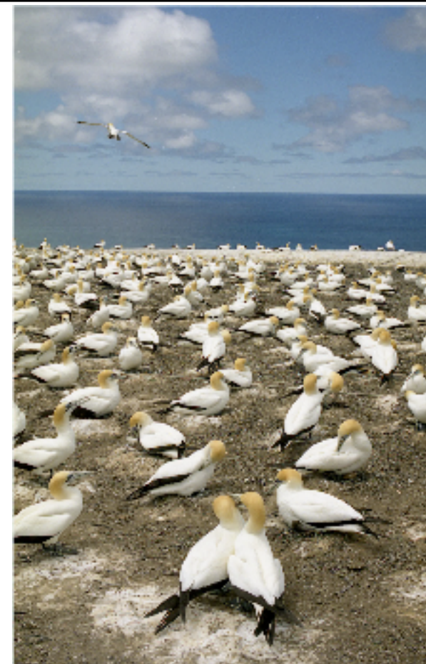
Gannets, Cape Kidnappers