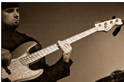
The House of Blues & Jazz by Shona Jaray Honours - KCPS Spring Salon

Round 5 has closed. The last round for 2009 is now open – entries must be in before 31 December. The website for more information is www.photography.org.nz/canon_online.htm .