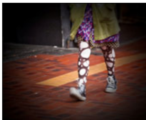
Mesh Stockings by Peter Beddek Accepted - Dunedin Festival of Photography