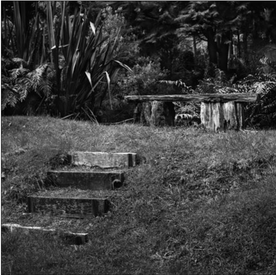
Rest Area by Michael Martin

Captured on a Hasselblad using a standard 80mm lens on 6cm x6cm format with Ilford Delta 100 film. I just liked the restfulness of the scene.